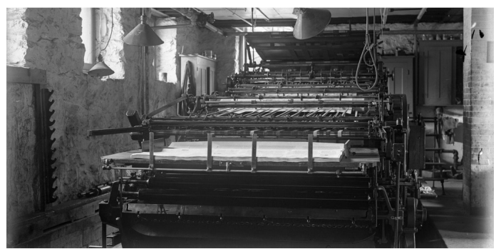
Top: Roycroft Print Shop c. 1930 Bottom: Huber Press in Roycroft Print Shop c. 1930