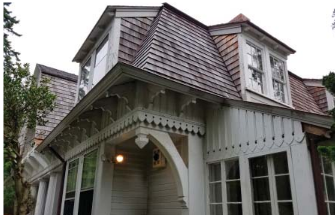
Detail of Hypotenuse House in Newport

In mid-September, I went back east to attend the 19th annual "Initiatives in Art & Culture" gathering in Rhode Island. While I had attended a National Trust for Historic Preservation conference in Providence in 2001 and the Victorian Society's Summer School in Newport a few years after that, this time I was coming for more of an Arts and Crafts immersion.