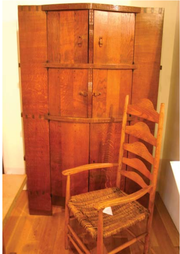
Cupboard by Ernest Barnsley (1899); armchair by Ernest Gimson (1895) for his own cottage. Quarter-sawn English oak, rush seat.

Ernest Gimson moved together to the Cotswolds (1893), settling in Sapperton, in search of 'the simple life'. And C.R. Ashbee, in the guise of a pied piper, led the migration of the Guild of Handicraft (with 70 artisans and their families!) from the squalor and smog of London's East End to the fresh air (symbolic and real) of Chipping Camden (1902), further north in the Cotswolds. In one of its many informative labels, entitled "Arts and Crafts in the Cotswolds/All Friends Together" The Wilson comments: "Many people were drawn to the Cotswolds thanks to the example of Gimson, the Barnsleys and the Guild of Handicraft. They included artists, musicians and writers, as well as makers. Local people worked with the designers, some of whom were craftspeople still working in traditional workshops. These people helped create a vibrant cultural scene in Gloucestershire that is still much in evidence today."