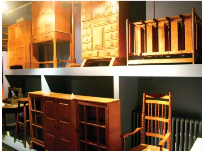
The back room, with objects crowded together on the floor and on high shelving. Above right, an oak umbrella rack for five umbrellas. (It rains a lot in England.)