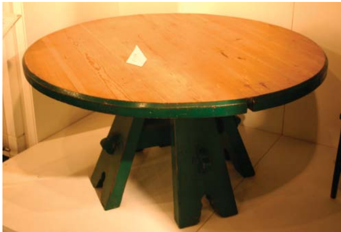
Sturdy table designed by William Morris for his student digs in 1856. Made of pine, in the days before he could afford more costly woods.

Why Cheltenham? in far Gloucestershire, on the edge of the Cotswolds? The early Movement centered on London. From John Ruskin, to William Morris and his crowd, the Pre-Raphaelites, Morris Marshall Faulkner & Co. (1861), and then Liberty Co. (1875) and The Century Guild (1882) – all creating, and selling, in the greater London area. Meanwhile, holding out against the worst excesses of Victorian cheap, machine-made, overly-ornate wares -- in rural Britain, in remote villages (like Rodmarton), craftsmen and craftswomen were still plying their trades. 'Back to the country' became an appealing idea. Possibly influenced by William Morris' and Dante Gabriel Rossetti's renting Kelmscott Manor in the southern Cotswolds as a summer retreat (1871), Ernest and Sidney Barnsley and