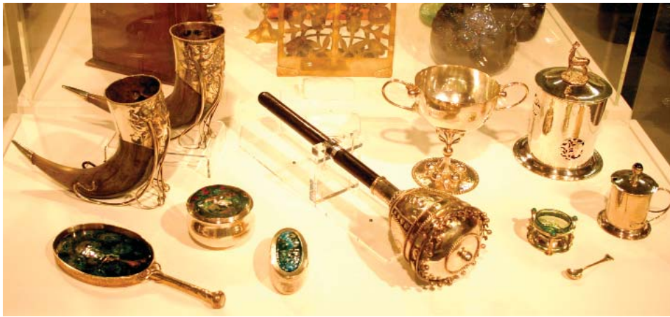
A case full of rich objects designed by C.R. Ashbee and fashioned by the Guild of Handicraft. In the left midground are two vases made of horn and silver; front and center a mace head, of silver set with green pearl blisters.