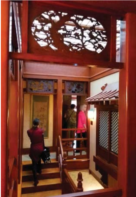
House of the Rising Sun in Fall River