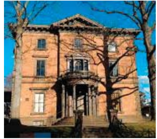
Lippitt House in Providence