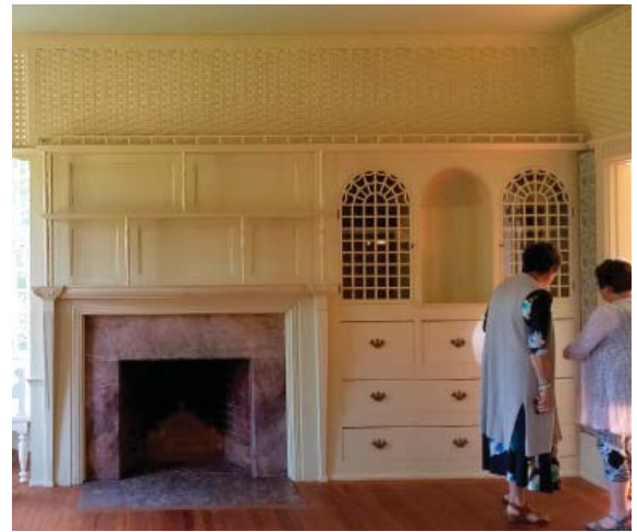
Isaac Bell House Interior in Newport

display for our group. Next door at the Handicraft Club, we viewed historically accurate doll houses and furniture created by the Tynietoy Company for children and collectors. Our day was capped off with a reception and panel discussion on the oft-overlooked role of women in art and architecture.