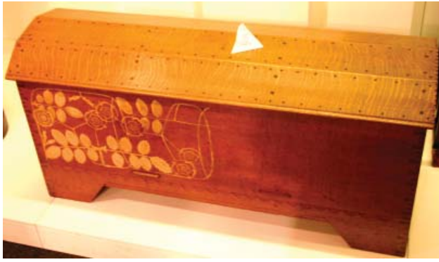
Coffer by Gimson (1910), English oak, with prominent medullary rays, and leafy design in gesso

Clergy seat, probably a prototype for his installation in Westminster Cathedral, by Gimson (1915). English walnut with bleached bone inlays. Churches often commissioned the more expensive and ornate pieces.