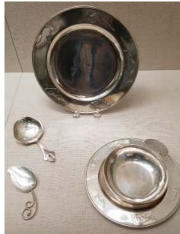
Gorham Children's Ware