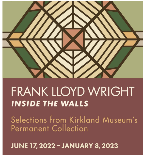
Logo for the exhibit, opening in June at the Kirkland