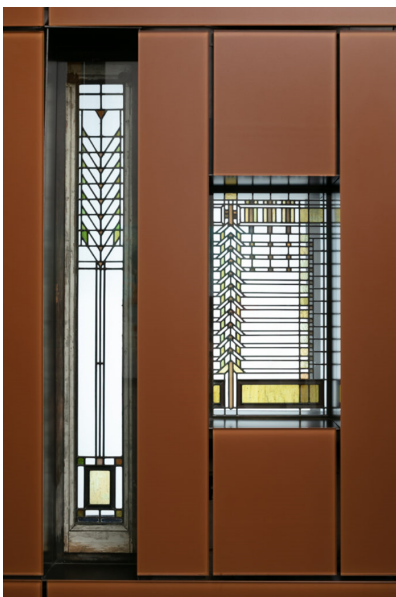
Two art-glass windows as displayed at the Kirkland until they were returned to the Darwin Martin House in April.

Starting in June, an exhibition of Frank Lloyd Wright (FLLW) holdings at the Kirkland opens in Gallery 12, and runs until early January of 2023. And the three-lecture series on Wright by national scholars which started in March, continues on 3 August and 13 October.