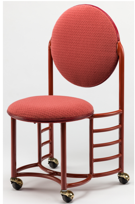
Wright chairs: infinite variety. A) from Heath House; B) from 'Broad Margins'; C) from the Johnson Wax building, exemplify the wide variety of chairs Wright designed.