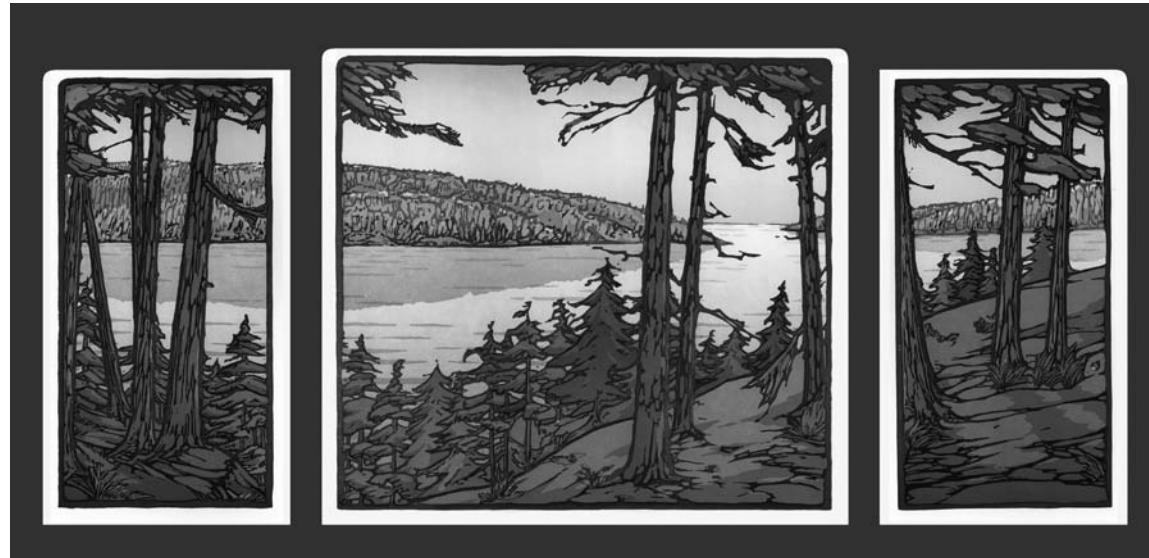
Colvos Passage Sunrise. Woodblock print by Yoshiko Yamamoto of The Arts and Crafts Press

of craftsmanship and attention to fine woodworking detail of this clock makes it a living icon of the art and philosophy of the Arts and Crafts movement—it was fun to watch visitors stop and admire the clock over the four days that I was at the conference.