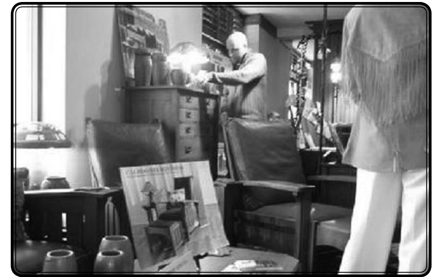
The Contemporary Craftsirms Show at the GPI Arts and Crafts Conference

After a late start, Saturday morning was spent having a great brunch at the Inn. But by noon I was ready to find that perfect (and affordable) piece of pottery to add to my small collection. On the way into the Antique Show I got