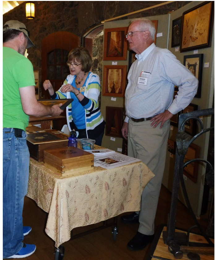
Rocky Mountain Marquetry Guild

Next year we hope to attract even more artisans from around the Rocky Mountain region to participate in what has grown into a celebration and exhibition of local craft whose aesthetic harkens back to the beginning of the American Arts and Crafts movement (c. 1900) and lives on as strong as ever.