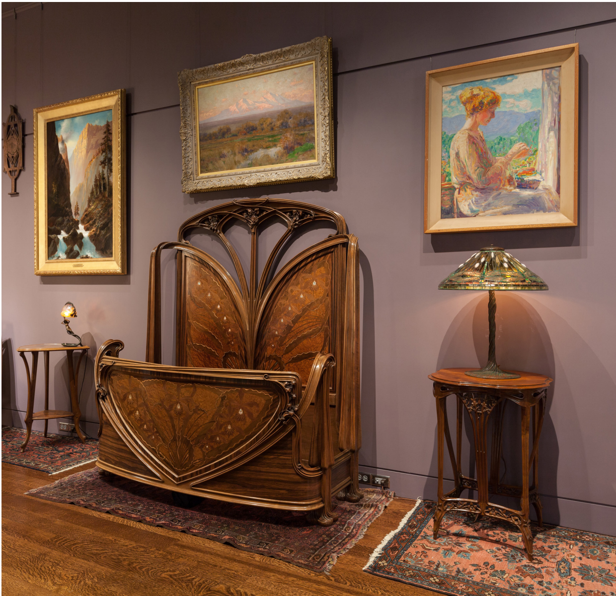
Majorelle Bed Room Shot