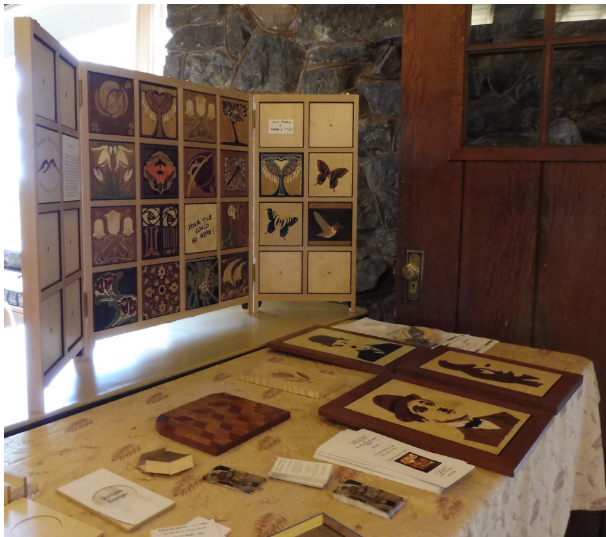
Colorado Woodworkers' Guild