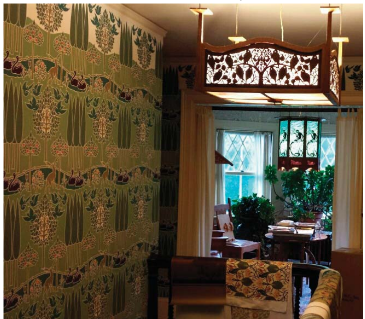
The stairwell with its spectacular chandelier and wallpaper.

third floors. As we ascended, our eyes were focused on a stunning chandelier lighting the stairwell. Asked where he had found this treasure with its bird and tree filigree motif, he answered, "I made it myself". Little did we