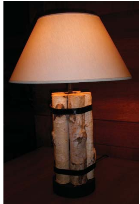
Log Lamps with White Shades