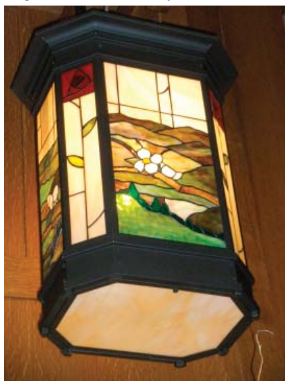
New Great Hall Wall Sconces