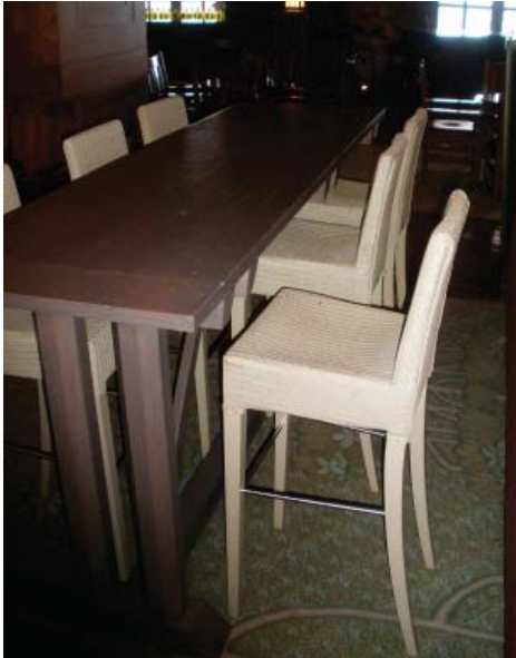
Wicker & Chrome Barstools

walk-in fireplaces at either end and andirons sixteen hands high. Most of that Arts & Crafts furniture has now been replaced by a hodge-podge of seats perhaps Mid-Century Modern(ish)? – that seem to fit no more with each other than with the few Arts & Crafts relics left in the Hall. This was the great disappointment for the Arts & Crafts crowd, and it was a topic of spirited conversation.