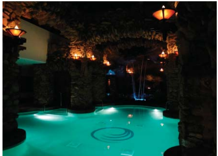
The Spa is Ranked in the Top 20 Resort Spas in the U.S.