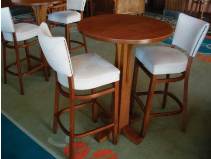
Arts & Crafts Tables Paired with White Upholstered Chairs

The original Inn was built on a steep hill, with the living quarters extending five stories upward. When the Vanderbilt and Sammons wings were added in the 1980s they extended at right angles from the old Inn, and down the hill. So you walk from the Great Hall of the old Inn (where the elevators go only upward), to the 10th floor of either wing (from which the elevators go only downward) It can be confusing at first. The long corridors on the top level of either wing command sweeping views of the 18-hole GPI golf course in the foreground and the city of Asheville in the distance. For many years there were Stickley rocking chairs in a long line by the panoramic windows in the Sammons wing, outside the ballroom where plenary seminars are held. Now there's a long line of new cabaret tables, with high stools. On the Vanderbilt side (surprisingly)