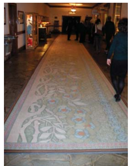
One of Many New Carpet Designs

In the Great Hall, both fireplaces blaze again, with 20 rocking chairs pulled up to each, where last year the south fireplace was out of commission. The massive columns, once encased in local rocks, have been wrapped instead in quarter-sawn red oak. There are 24 new generously-large sconces adding to the lighting, each with Dard Hunter rose motif and stylized landscape done by Old California Lantern Co. There is a large old Roycroft sideboard, holding the urns of chilled water with fruit slices. One of the huge 1913 Roycroft grandfather clocks has been moved back to its original location just inside the Great Hall. Throughout the public rooms there are new Arts & Crafts-inspired carpets; some of them must be 50 feet long. (The carpets generally found favor, though some aficionados noted that the colors were a little subdued; a closer adherence to