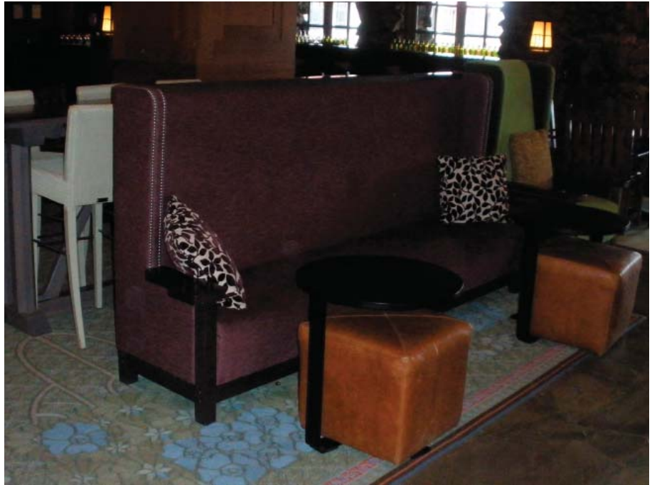
Mod high-back chairs and loveseats block the view of the fireplaces from most vantage points in the Great Hall.