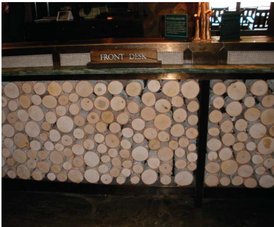
New Front Desk with a Cut-log Motif